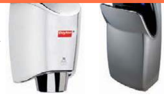
No. 6PGK6 No. 19UC76

Triple-plated, brushed chrome finish hides smudges and fingerprints. No. 1GVL9 has a 1/10 HP shaded pole brushless motor.