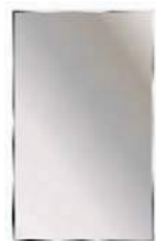
No. 6MX Y5