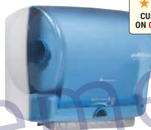
Impulse 10 No. 2XLH4