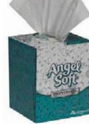
Cube No. 2KRF3