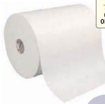
White No. 3EB46