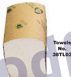
Towels No. 38TL03