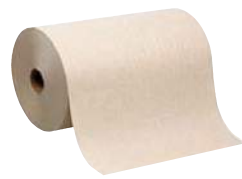
Brown No. 5UWL7