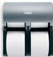
Vertical Quad Roll No. 4DJU4