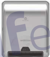
Recessed No. 2NY13