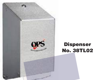
Dispenser No. 38TL02

# Meet EPA guidelines for post-consumer recycled fiber content.