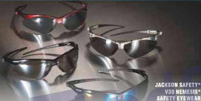
JACKSON SAFETY* V30 NEMESIS* SAFETY EYEWEAR